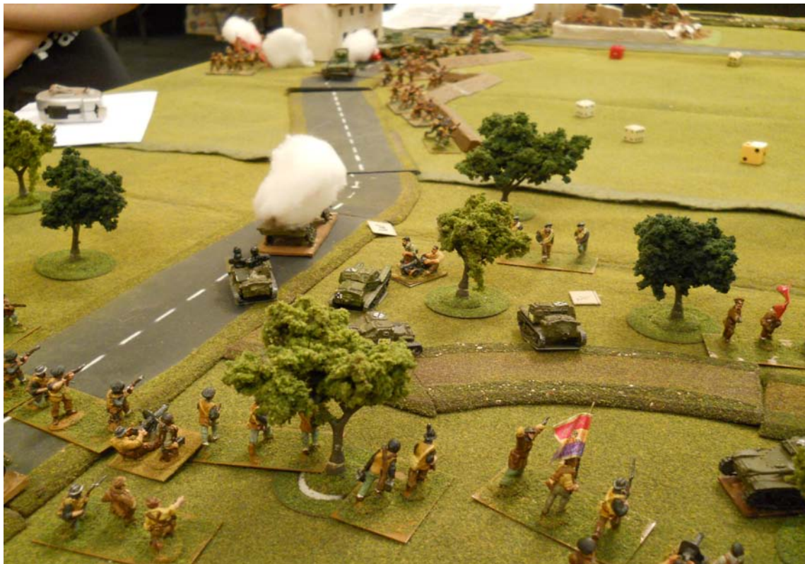
Tankettes Massacre A Truck Borne Battalion