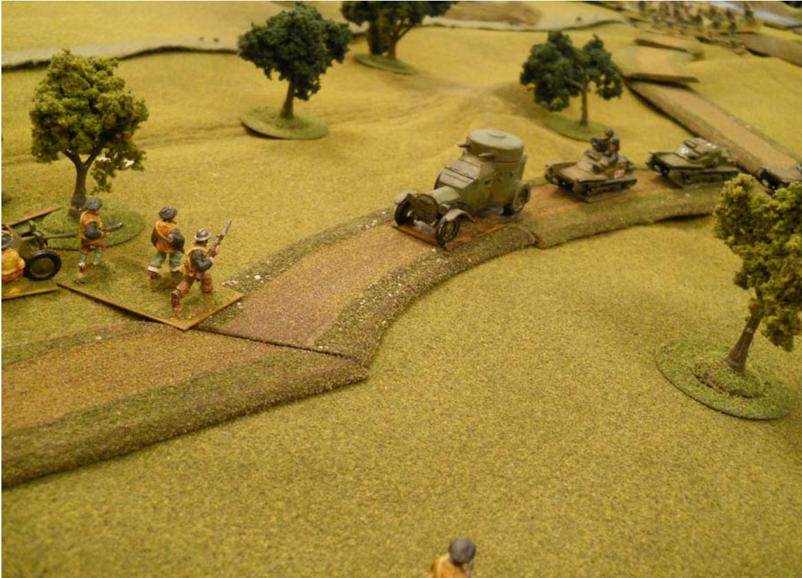
Attack of the Rapid Support Group