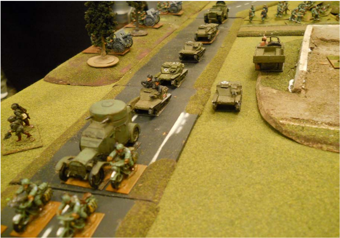
Rapid Support Group on the Brihuega Road