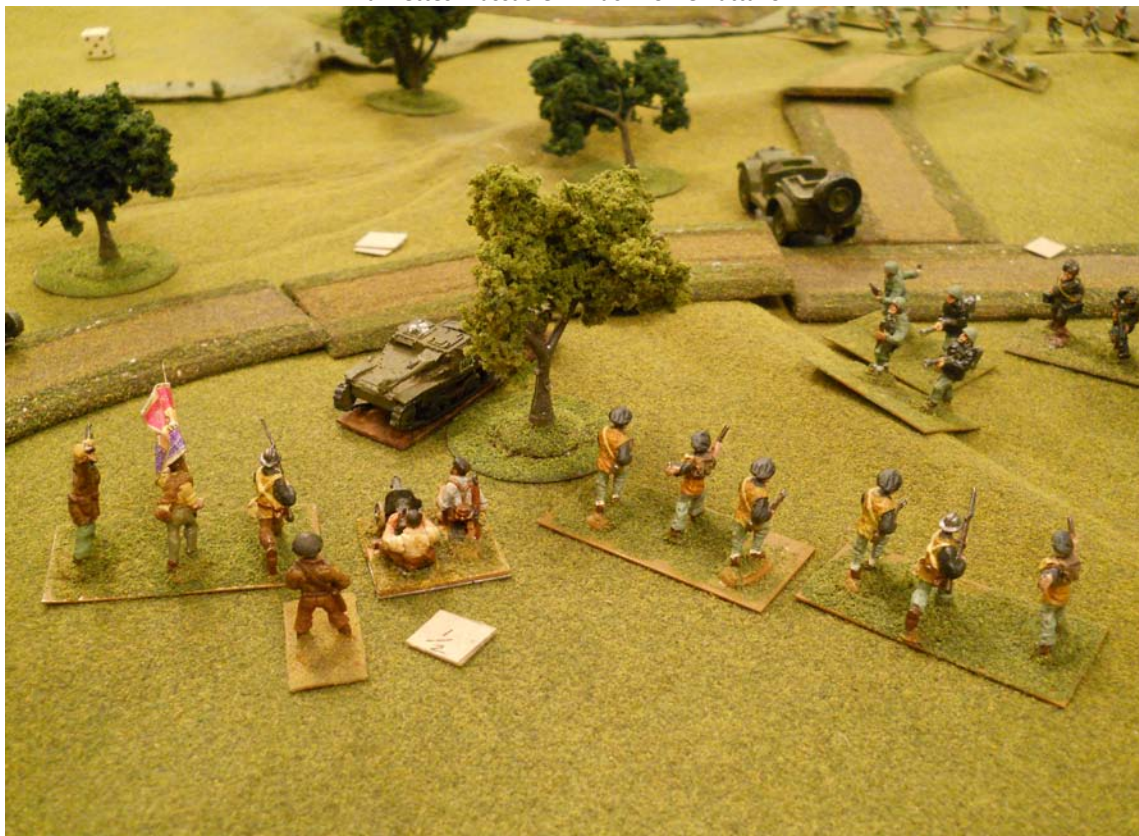
Flame Thrower and MG elements Meet Internationals at the Edge of the Bosque