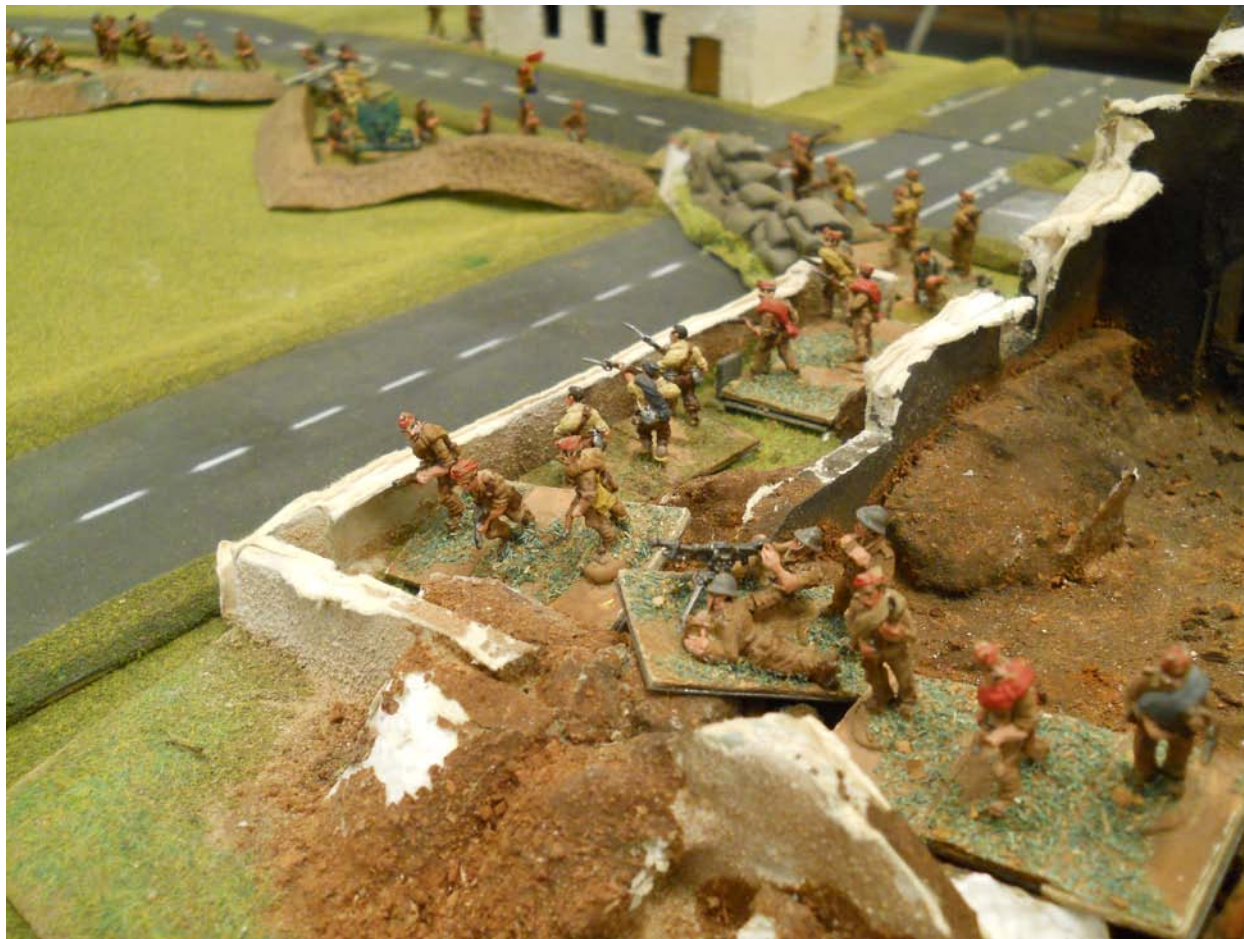
Elements of the 1 st Bis, A Spin Off of the PCE 5 th Regiment Dug In at Trijuique

This game at SIEGE OF AUGUSTA XX (2011) was again based on the struggle of the XI Republican Division under Col. Enrique Lister to hold the road to France from the Italian CTV Littorio Motor Division under General Annibale Bergonzoli. The Republicans had two infantry Brigades, the 1 st Bis, based on the Partido Comunista Espagnol (PCE) militia of Madrid (prewar) and the XI International Brigade containing the Andre Marty, Thaelmann, and Edgar Andre battalions of French and German Communists respectively. These formations had limited support weapons but were fairly well trained except for some militia battalions used to bring them up to roughly four battalions each. They were to have had a couple of off the board gruppos, and their ace in the hole was a detachment of two T-26b Russian tank companies armed with 45mm AT turret guns.