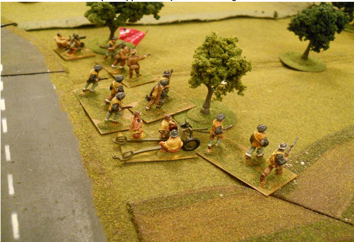
Andre Marty Battalion Enters the Bosque de Torija with Hotchkiss AT battery