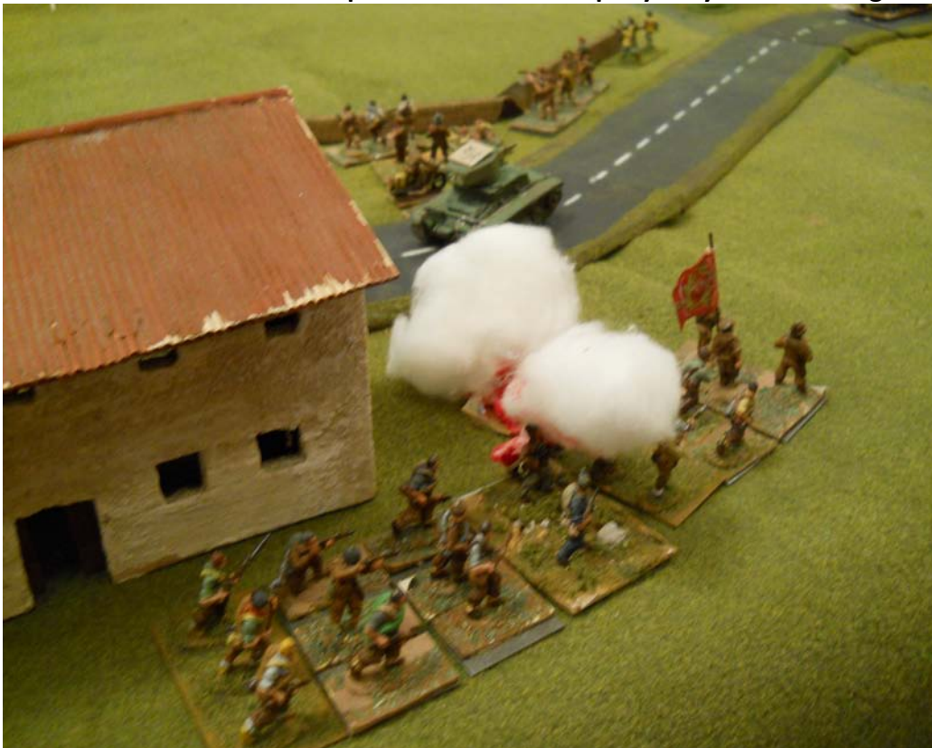
At that point the reserves headed towards the breakthrough. Here a militia battalion is struck by an overshoot fired at the Russian tanks by Littorio's artillery