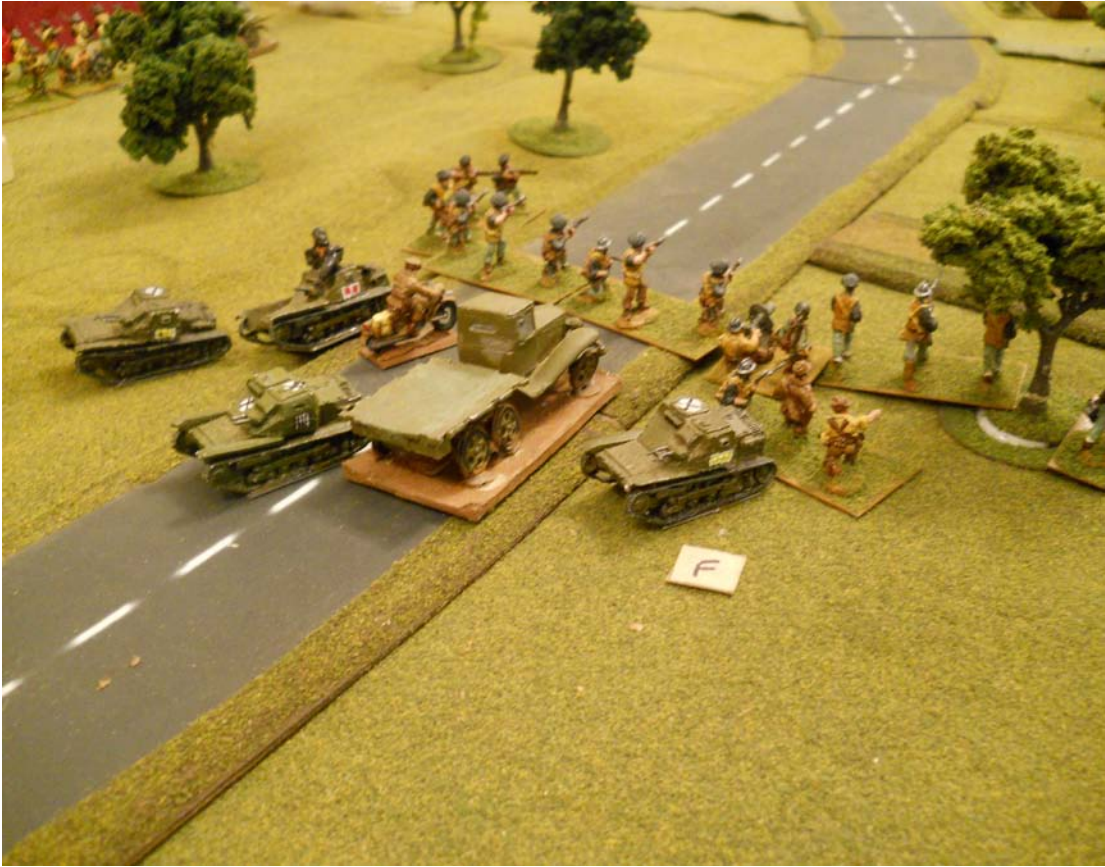
Charging Away From the Dread Russian Tanks, the Tankettes Break the Last Battalion of the XI Internationals

Once again the CTV had reversed history. I'm obviously going to have to tighten up the rules and pay closer attention when they next launch a Blitzkrieg with silly little tankettes. Even with the recent reverses, overall the Republicans are ahead in the series, both when it comes to the Caratarra Battle near Trujique and the storming of Brihuega down the road.