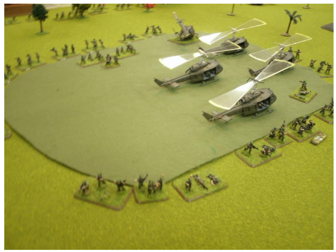
Club Treasurer Webb Pierce Brought Back Vietnam Complete With Helicopters