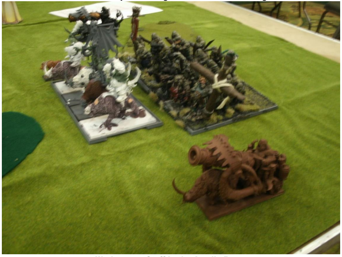
Warhammer Stuff In the Amelia Room