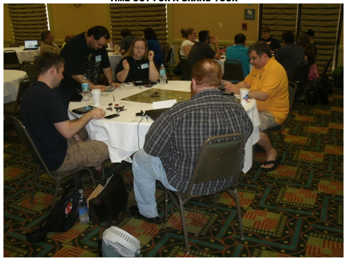
RPG Stuff In CITRUS B