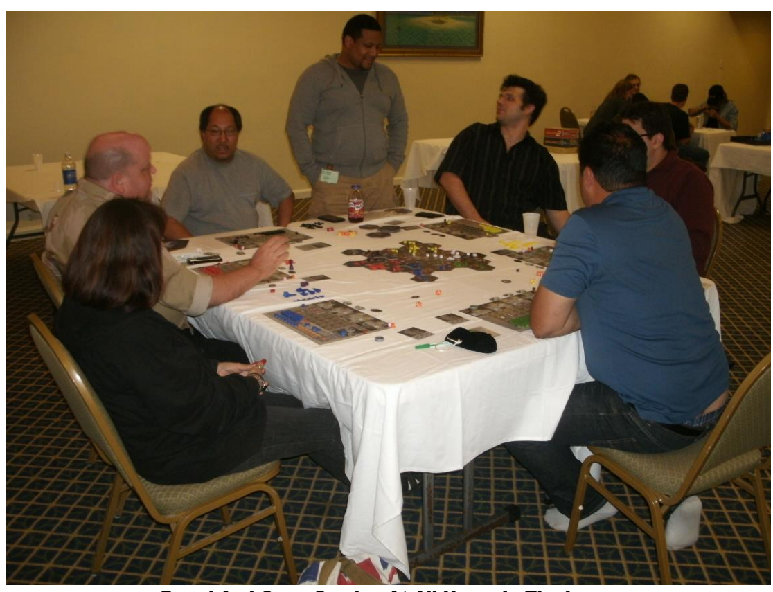
Board And Open Gaming At All Hours In The Largo