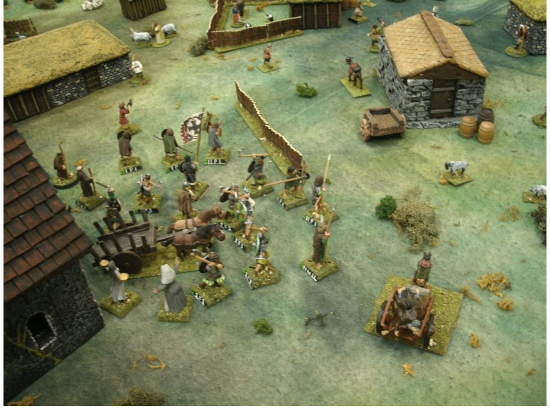
But For All That The Most And Best Was In The Main Room-Including Gallagher's Pig Wars