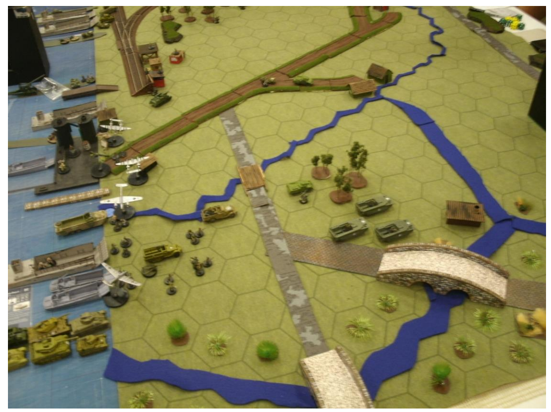
There Was WW II From Small Scale Landings