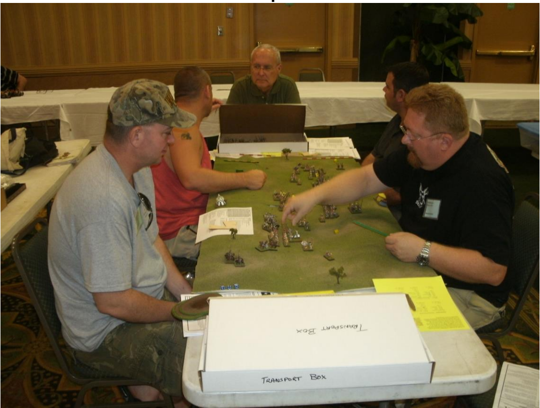
On This Table It Was DB Something Or Other All Convention Long