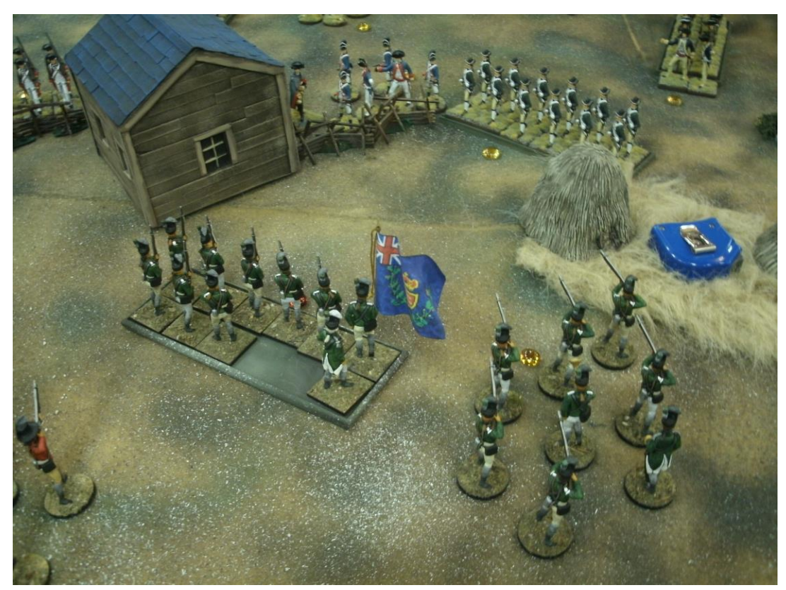
On The Whole The ACW Stuff Seems To Me Artistically Superior