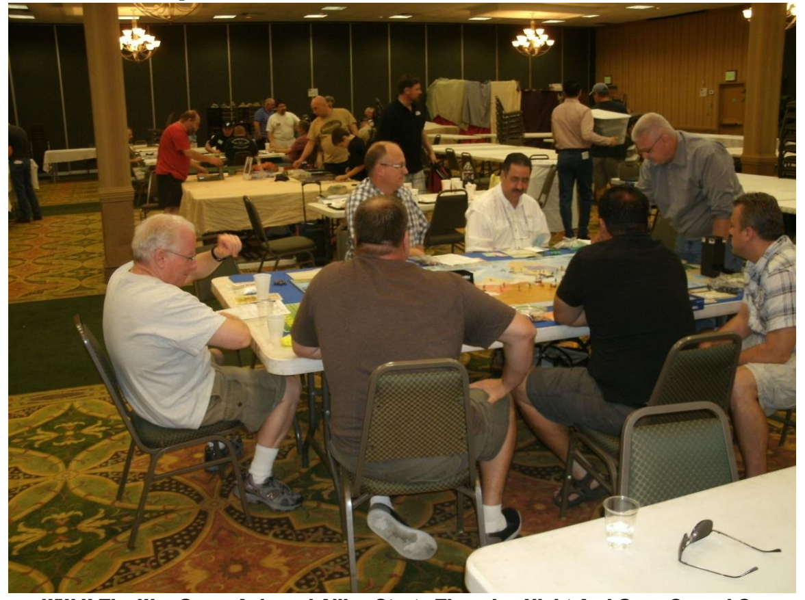
WW II The War Game-Axis and Allies Starts Thursday Night And Goes On and On

RECON returns to the familiar facility on International Drive-now International Palms. More than adequate space, a nice location, reduced room costs, and a colorful slate of games.