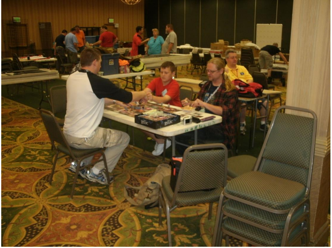
There Were Some Of Each On Hand As The Convention Ran Down Sunday