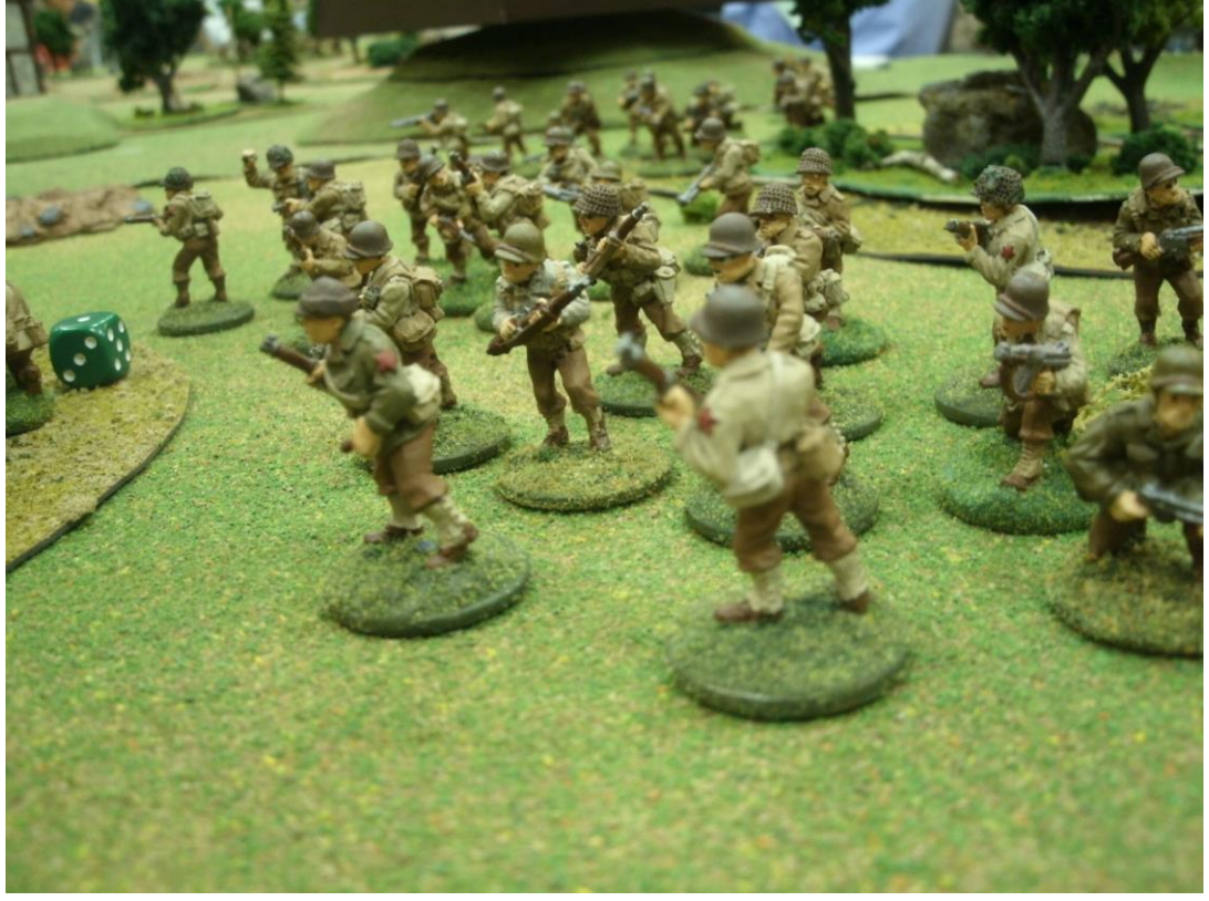
To Up Close And Personal With Bolt Action