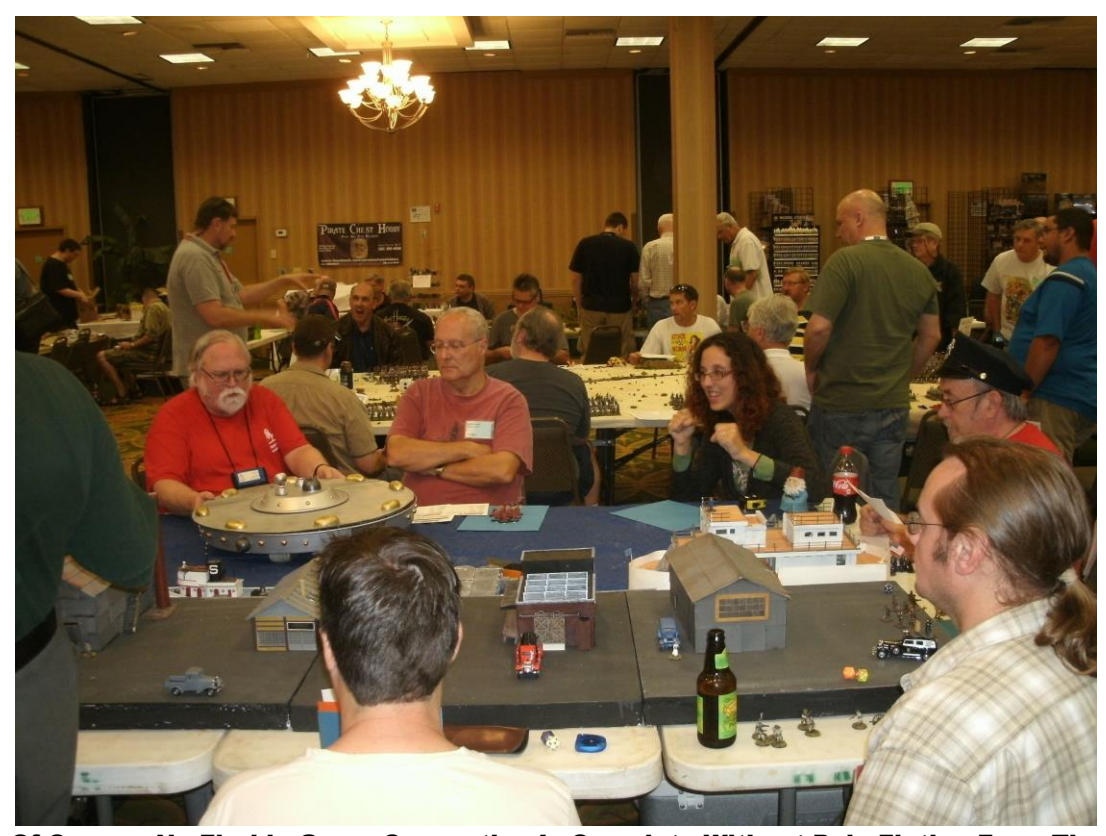
Of Course, No Florida Game Convention Is Complete Without Pulp Fiction From The Jacksonville Garrison