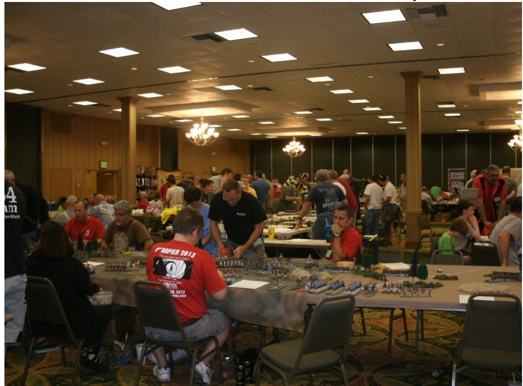
ATKM's Epic Was A War of Independence Game