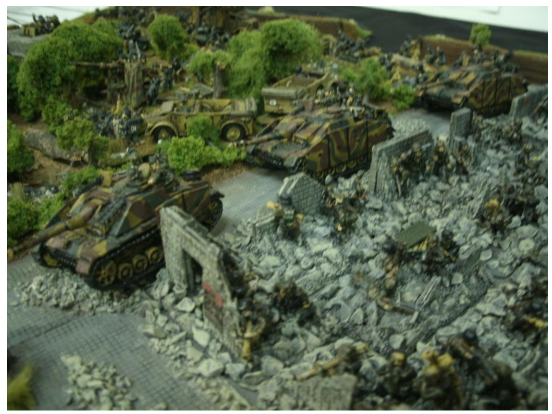
And Flames Of War In Sanibel-I Think These Are Dutch SS Volunteers