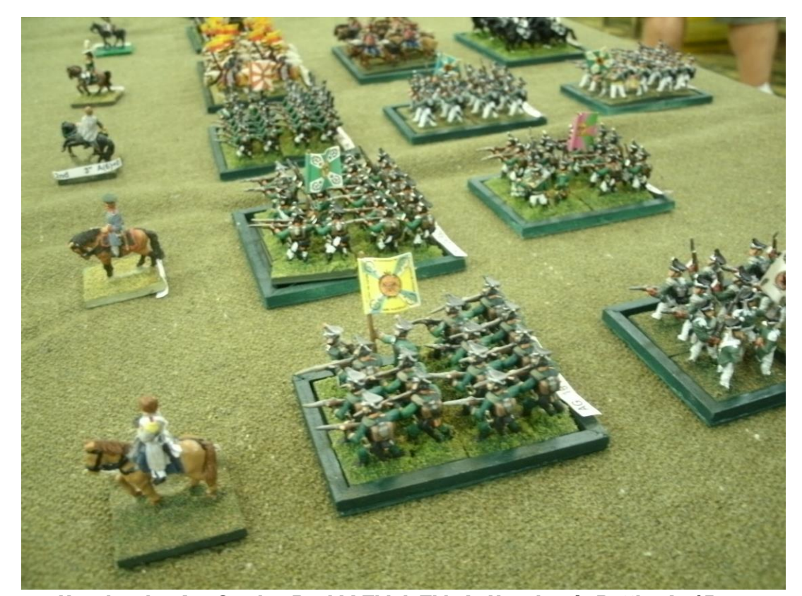
Napoleonics Are Coming Back! I Think This Is Napoleon's Battles In 15mm