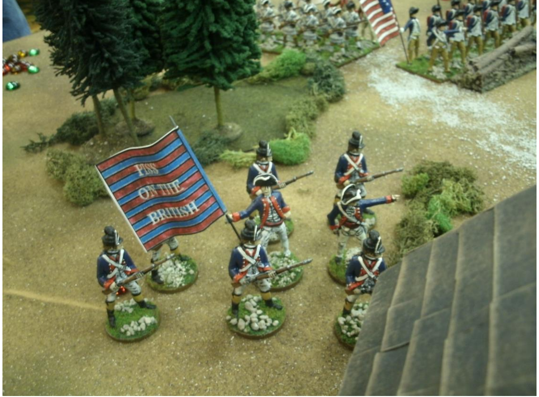
But There Are Subtle Flourishes