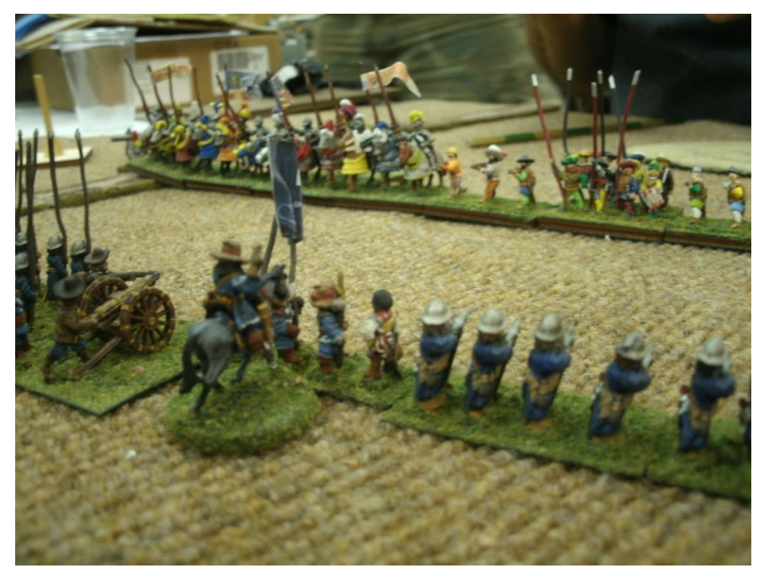
This DB is RRR-The Commander On Horseback Is Said To Be Reading A Bible