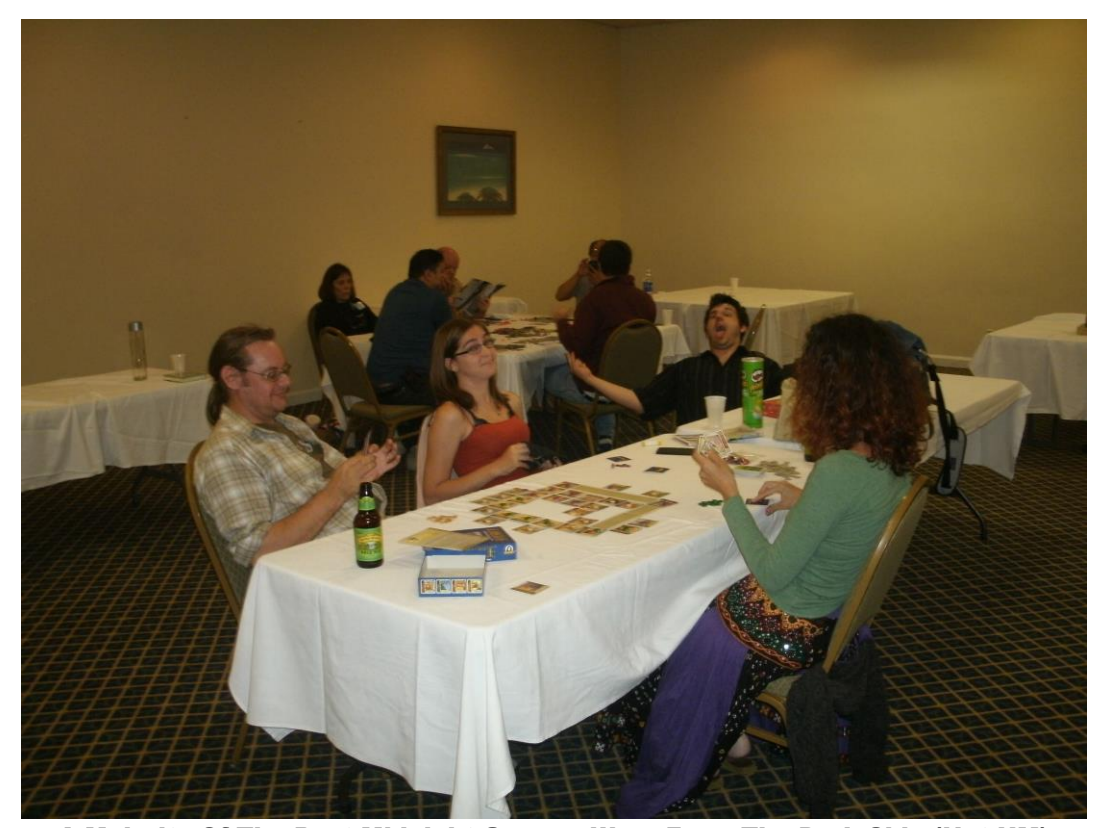
A Majority Of The Post Midnight Gamers Were From The Dark Side (Not HM)