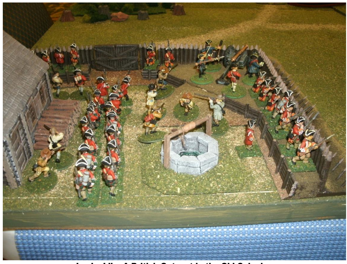
Looks Like A British Outpost in the Old Colonies