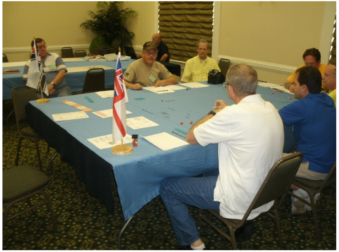
SEEKRIEG IN MARCO