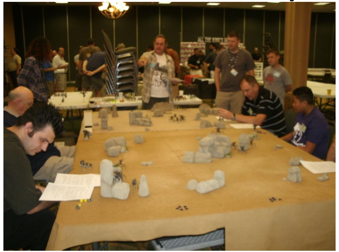
Dark Side Rising-Something About Star Ship Troopers And Bugs