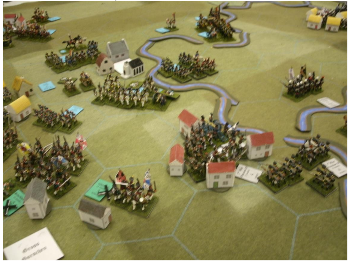
Probably Command And Colors In 12mm