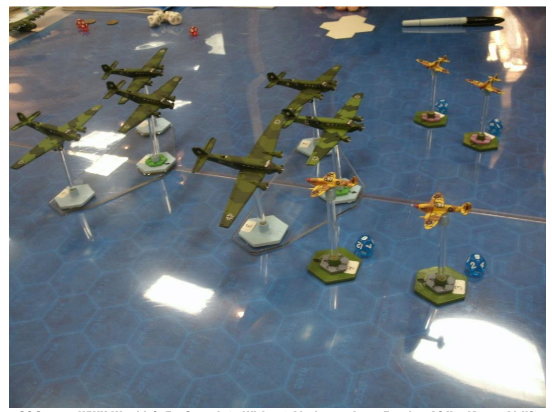
Of Course WWII Wouldn't Be Complete Without Airplanes-Jerry Bowles Afrika Korps Airlift