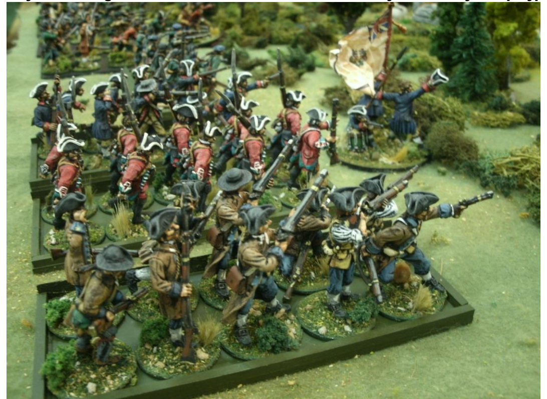
Bob Moon's French And Indian War 40mm Figures Are Works Of Art